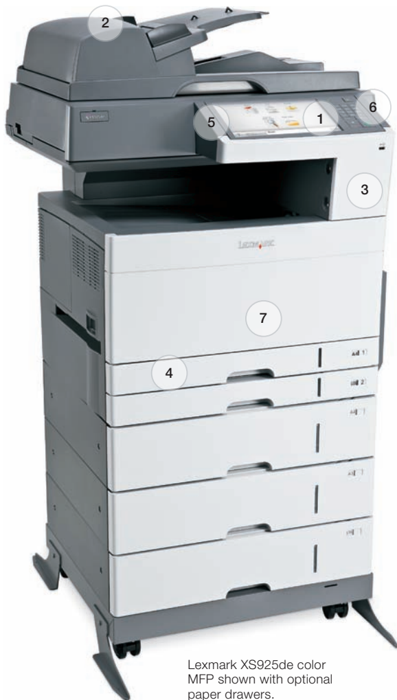
Lexmark XS925de color MFP shown with optional paper drawers.